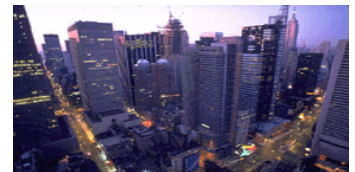
California Test-Only Industry a vital partner in clean-air.